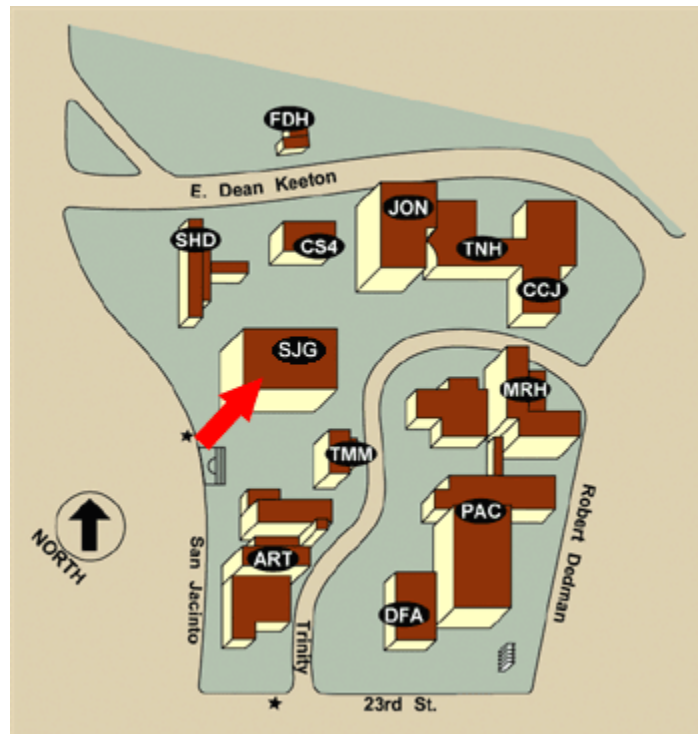
San Jacinto Garage (SJG) is available for public parking ($9/day)