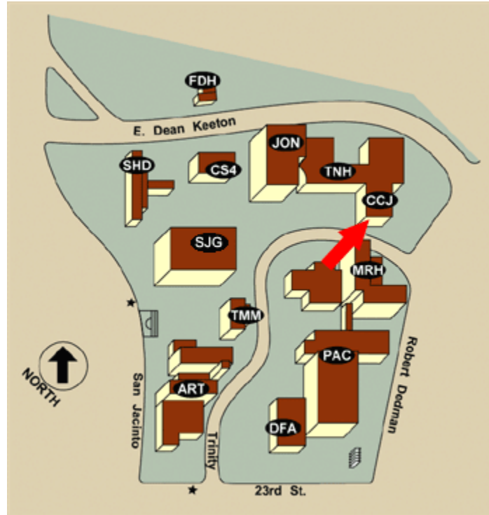
The Eidman Courtroom and Jamail Pavilion are located in the John B. Connally Center for Justice (CCJ)